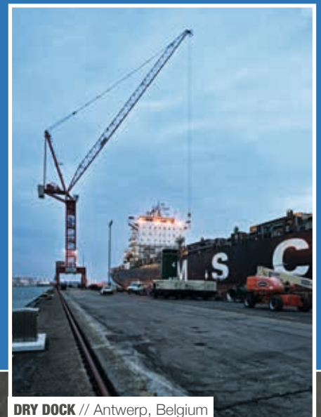
DRY DOCK // Antwerp, Belgium