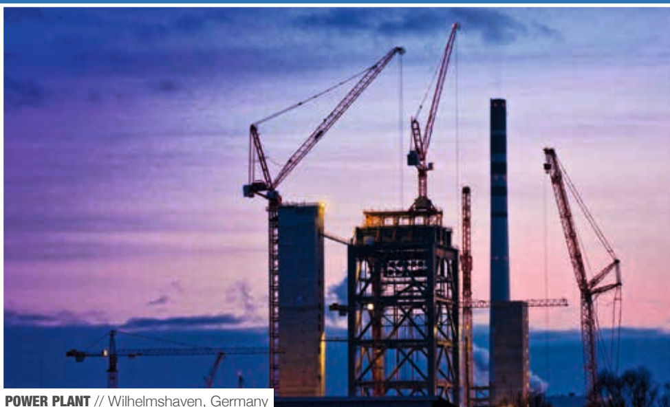
POWER PLANT // Wilhelmshaven, Germany