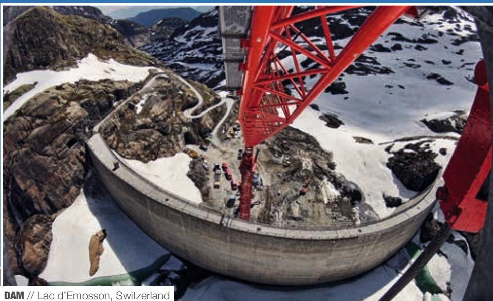
DAM // Lac d'Emosson, Switzerland