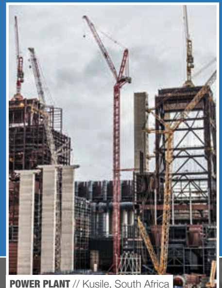
POWER PLANT // Kusile, South Africa